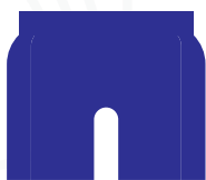
Navy blue cargo shorts